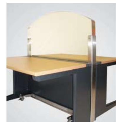
PET counseling desk