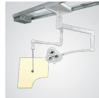
Fixed barrier for X-ray radiation shielding system