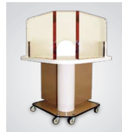
FDG administration radiation shielding table