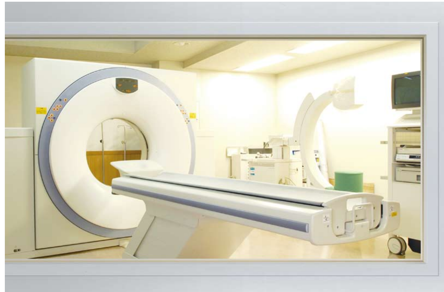
Viewing window for CT room