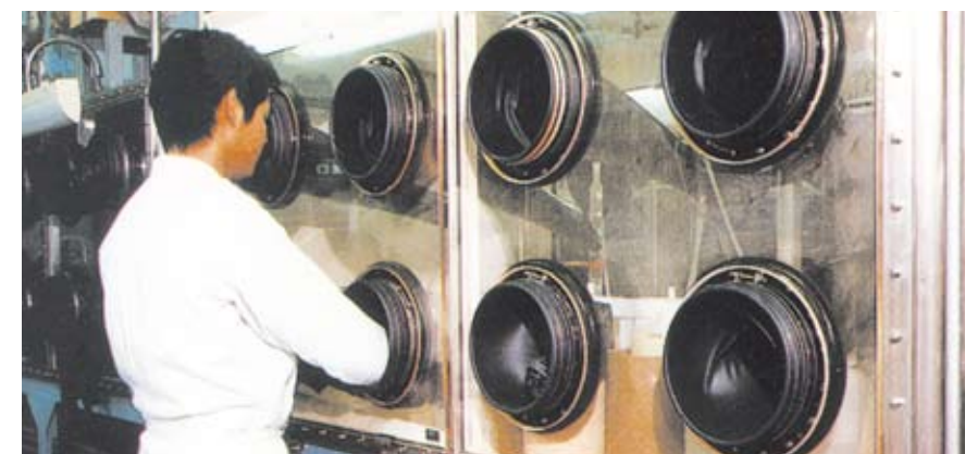
Front panel of glove box