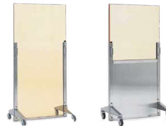
Mobile barriers for radiation shielding