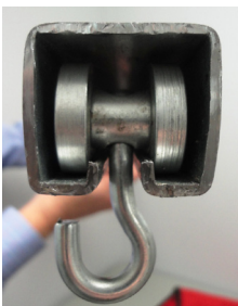
Curtain track hardware